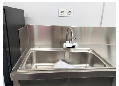
- Sink -