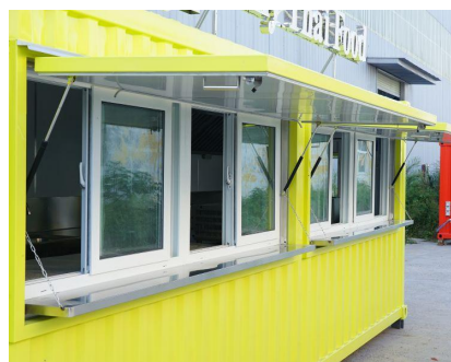
- Windows -