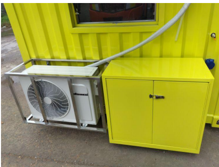
- Generator Cage & Air Conditioner -