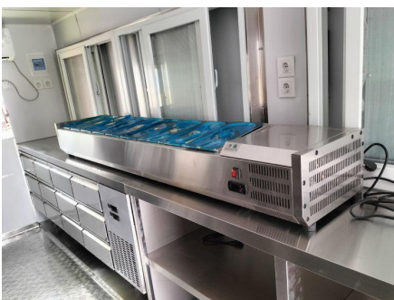
- Refrigeration -